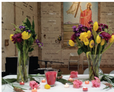
A beautiful table of flowers and candles offers a peaceful display at the Music & Memories service at Holy Cross.