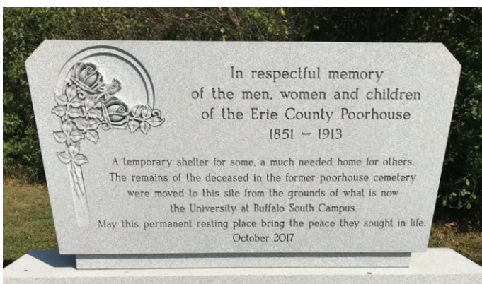
Monument donated by Stone Art Memorial marks new burial area.

Cremation options have been expanded with the addition of eighty-eight new granite front niches that were added to Morning Star Garden Mausoleum last fall. Each niche will be memorialized with a bronze plaque. The lovely chapel near the office has undergone renovations including the addition of 72 single and double niches with both marble and glass fronts. Each glass niche has special LED lighting creating a heavenly glow. New carpeting and improved lighting throughout the Chapel complete the renovations.