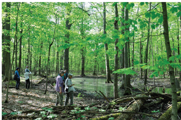
Margery Gallogly Sanctuary photo of Assumption property.

The Western New York Land Conservancy approached Catholic Cemeteries in 2016 about the possibility of purchasing an unusable parcel of land. The majority of the undeveloped acreage was not suitable for future cemetery use because of its designation as wetlands. The Land Conservancy set out to raise the money necessary to purchase this undeveloped property to create the Margery Gallogly Nature Sanctuary.